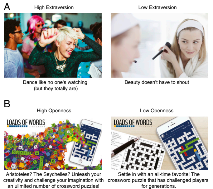
Fig. 1. Examples of ads aimed at audiences characterized by high and low extraversion (A) as well as high and low openness (B). Fig. 1A, Left courtesy of Caiaimage/Paul Bradbury/OJO+/Getty Images; Fig. 1A, Right courtesy of Hybrid Images/Cultura/Getty Images.

Study 1 demonstrates the effects of psychological persuasion on people’s purchasing behavior. We tailored the persuasive advertising messages for a UK-based beauty retailer to recipients’ extraversion, a personality trait reflecting the extent to which people seek and enjoy company, excitement, and stimulation (18). People scoring high on extraversion are described as energetic, active, talkative, sociable, outgoing, and enthusiastic; people scoring low on extraversion are characterized as shy, reserved, quiet, or withdrawn. Given the specific nature of the product, we only targeted women. Fig. 1A displays 2 (out of 10) ads aimed to appeal to women characterized by high versus low extraversion (we refer to the personality of the audience an ad is aimed at as ad personality ). Using a 2 (Ad Personality: Introverted vs. Extraverted) × 2 (Audience Personality: Extraverted vs. Introverted) between-subjects, full-factorial design, we ran the Facebook